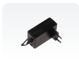
48 V 1.2 A power adapter