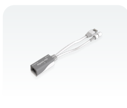
Gigabit PoE injector